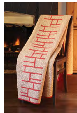
Just Passing Through