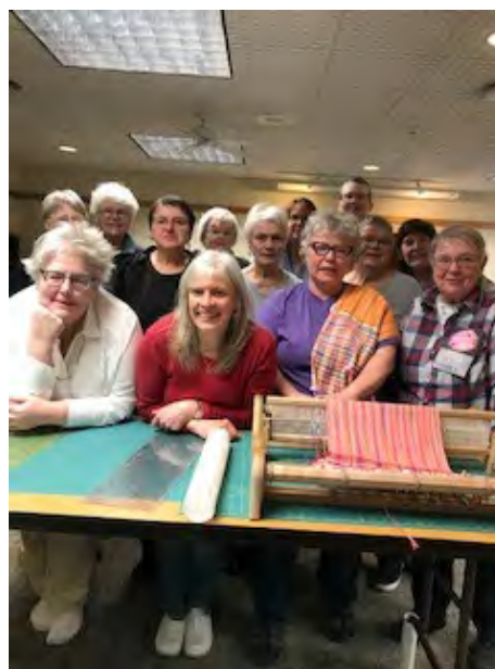
Attendees at the recent retreat at Prairiewood, February 14-16

July 13 - 2020 Challenge: Quilts with Words